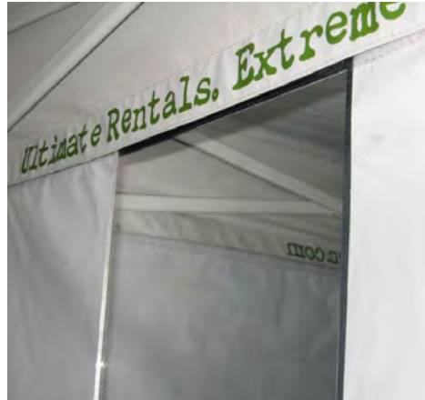
5. To install the mirror panel, position it using the attached Velcro to any section of wall sliding it in between the canopy and sidewall to grasp the Velcro firmly.