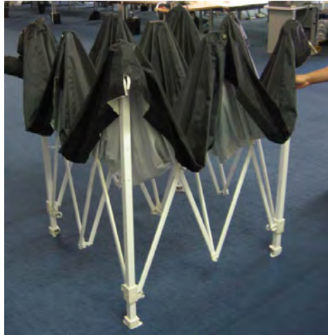
2. For quick assembly, remove the accessories and start with the frame first. The frame is easily walked into an open position with just 2 people. Pull on opposite diagonal corners to fully extend the canopy and snap it into place, then extend the legs to the top, most extended position.