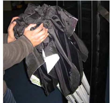
6. Packing it up is as easy as 1-2-3. Remove the clip light and store the mirror in the protective bag. Peel away the sidewall and fold it neatly. Press the silver buttons on each leg to lower, and then pull rings to release, and walk to the center to collapse. The compacted frame with canopy attached will drop into the bottom of the molded case, followed by the folded sidewall, mirror and light fixture.

Pop on the lid and roll off to the next event.