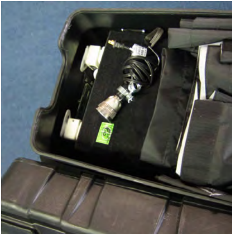
1. Opening the case will reveal the LED light, safety mirror, sidewall and dressing room frame.

You are going to love the convenience of our portable pop-up rooms. Used to create tech spaces, or as a dressing room, they are quick and easy to set up and travel conveniently in a roadworthy wheeled case. Assembly instructions: