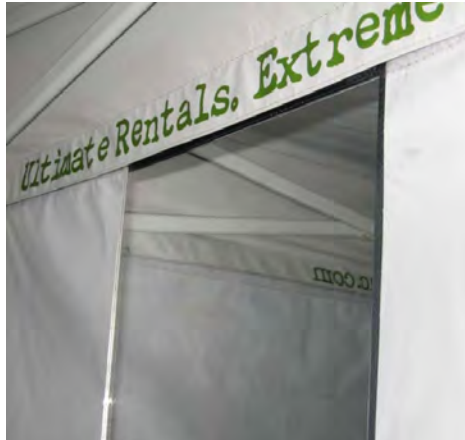
5. To install the mirror panel, position it using the attached Velcro to any section of wall sliding it in between the canopy and sidewall to grasp the Velcro firmly.