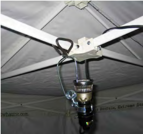
4. The compact LED light fixture is installed by clipping it to the center of the roof frame. Be sure to point it up to face the white ceiling. This will provide bright, evenly reflected light. Run a power cable off to the side and down one of the legs and plug it into standard 110v power.